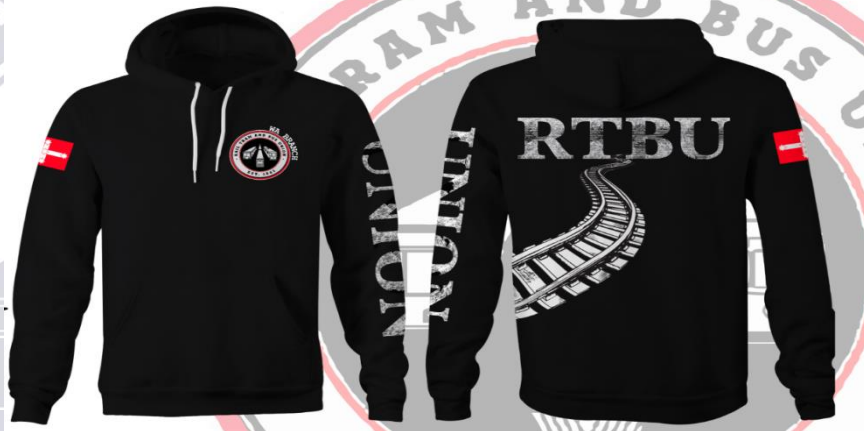
RTBU WA Hoodie! Unisex sizes available $60 each, $75 with postage