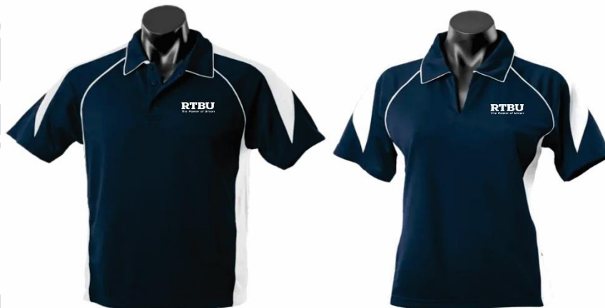
RTBU WA Polo T-Shirt! Ladies and Men's sizes available $45 each, $60 with postage

Do not hesitate to call or email the office general@rtbuwa.asn.au to enquire if your size is available and organise payment.