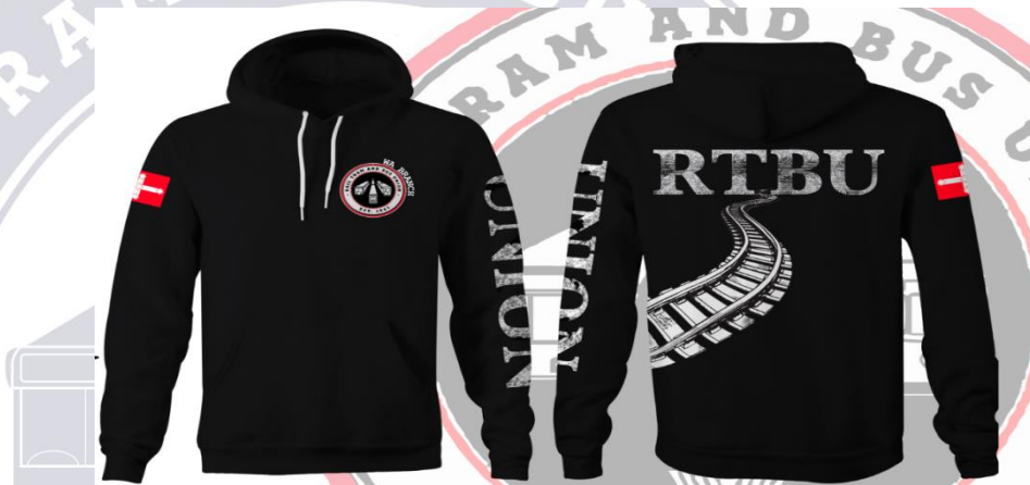
RTBU WA Hoodie! Unisex sizes available $60 each, $75 with postage